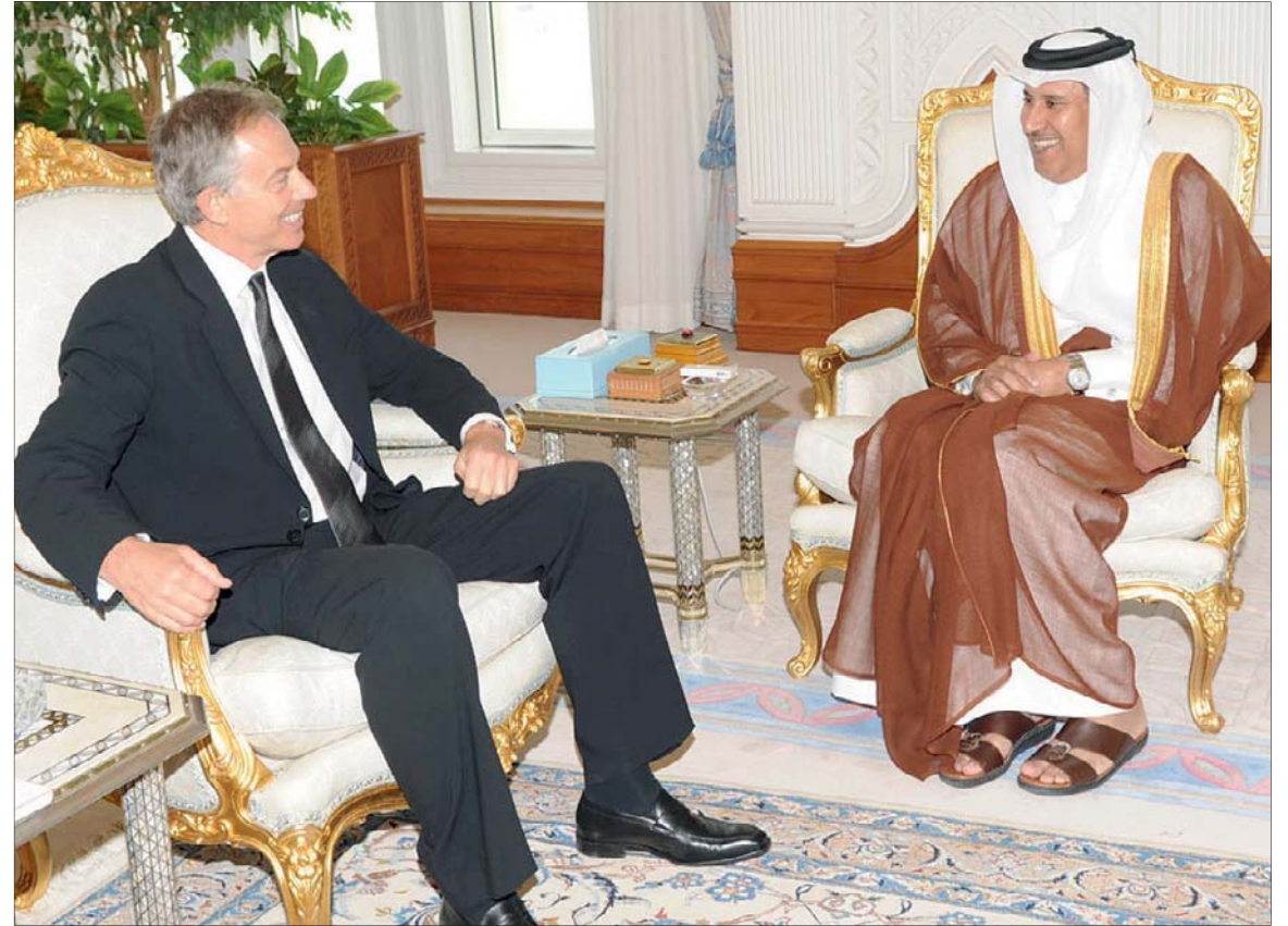
HE the Prime Minister and Foreign Minister Sheikh Hamad bin Jassim bin Jabor al-Thani yesterday met the Quartet's envoy to the Middle East, Tony Blair, during his visit to Qatar. They discussed the Quartet's efforts to bring peace to the Middle East.