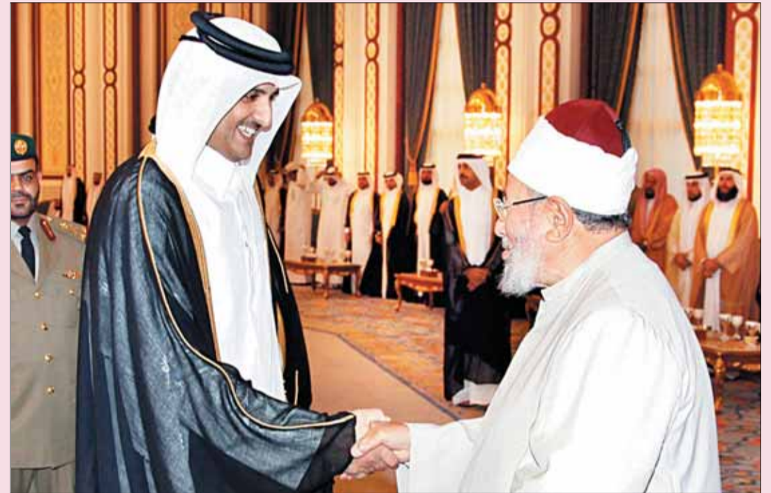
The Heir Apparent His Highness Sheikh Tamim bin Hamad al Thani with Islamic scholar Sheikh Yousuf al Qaradawi at an Iftar organised in the honour of scholars, judges and elders, in Doha, on Wednesday.